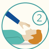
Check Vital Signs