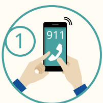
Call Emergency Number