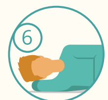
Turn Casualty On Side