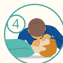
Give Rescure Breaths